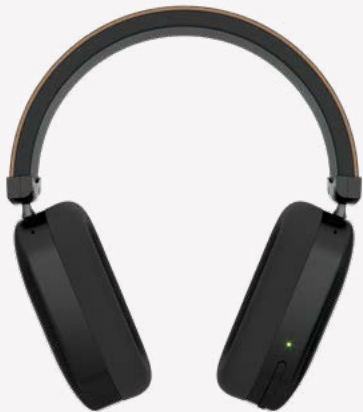
Kaiku Wave Headphone